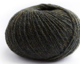
69M Tanne* Fir