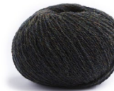
74M Seegrass* Seagrass