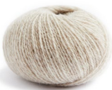
47M Muskat* Muscat