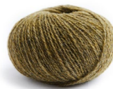
70M Farn* Fern