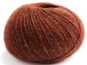
25M Kupfer* Copper